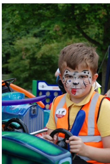
Mad Hatters Tea Party at the Botanical Gardens...