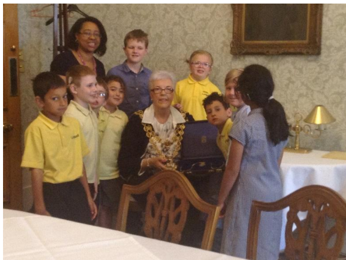
We visited the Council House...