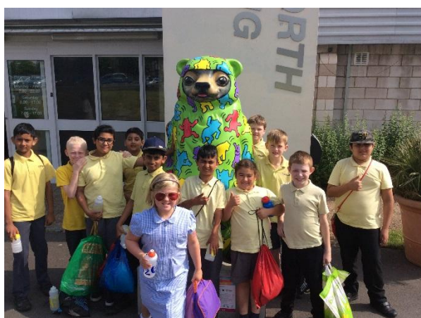
Winners and Runners Up in the Panathlon Swimming Gals...